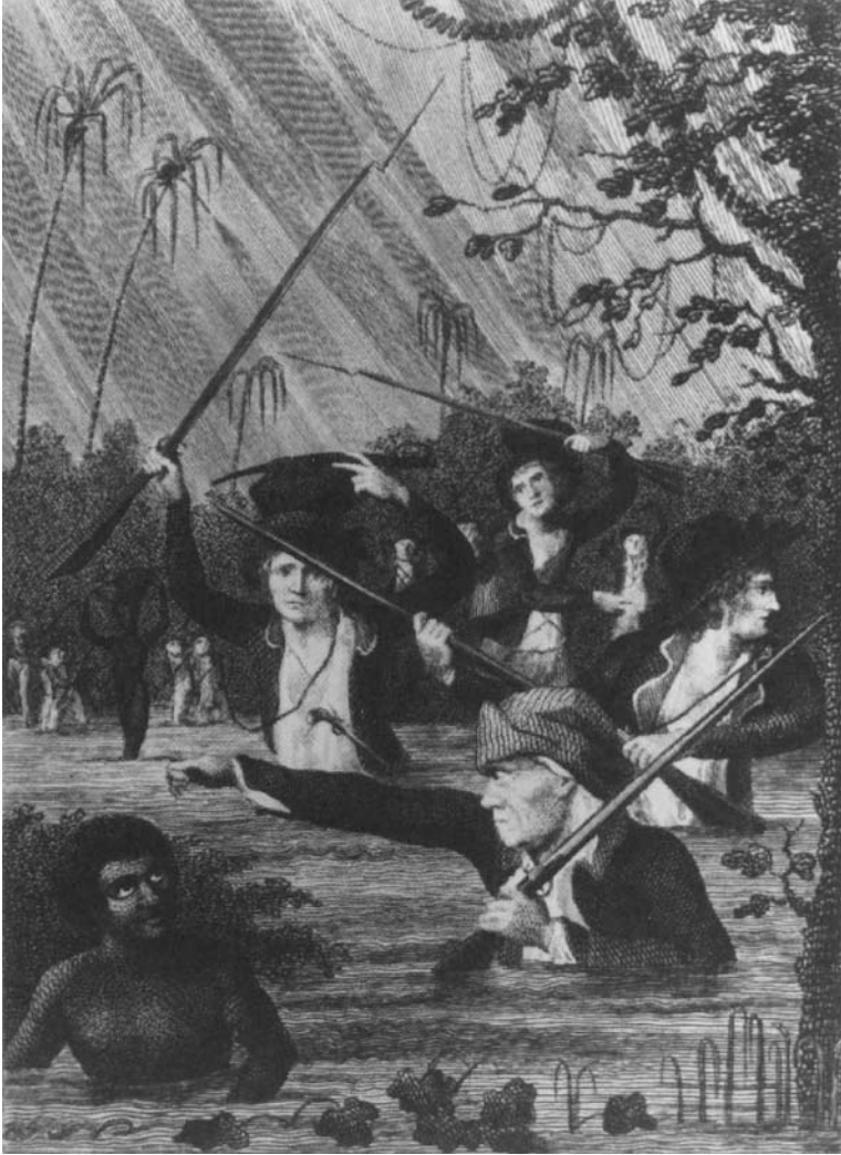
Dutch soldiers and guide in a Suriname swamp, c. 1775, by William Blake.

John Gabriel Stedman, Narrative of a Five Years Expedition against the Revolted Negroes of Surinam (1796).