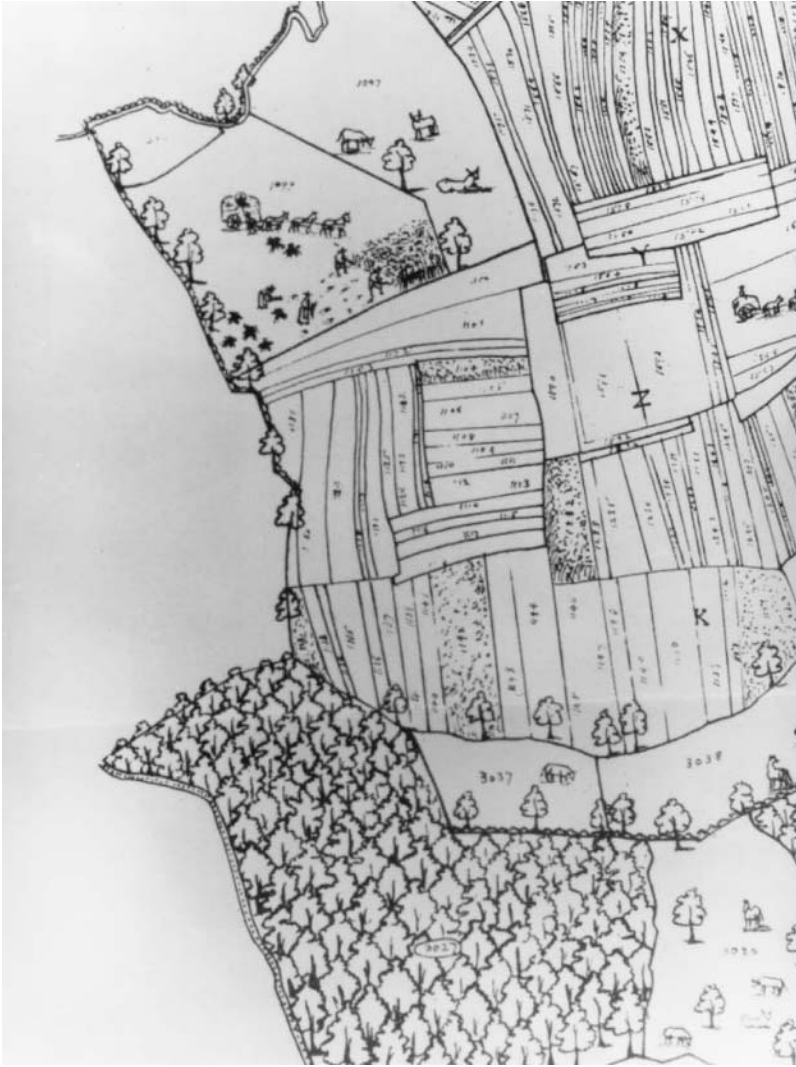
Open-field farming in Laxton, England, 1632. Booke of Surveye of the Manor of Laxton (1635).

absence of “bourn, bound of land, tilth” was not an ideal dream but a recent, and lost, reality, an actual commons.