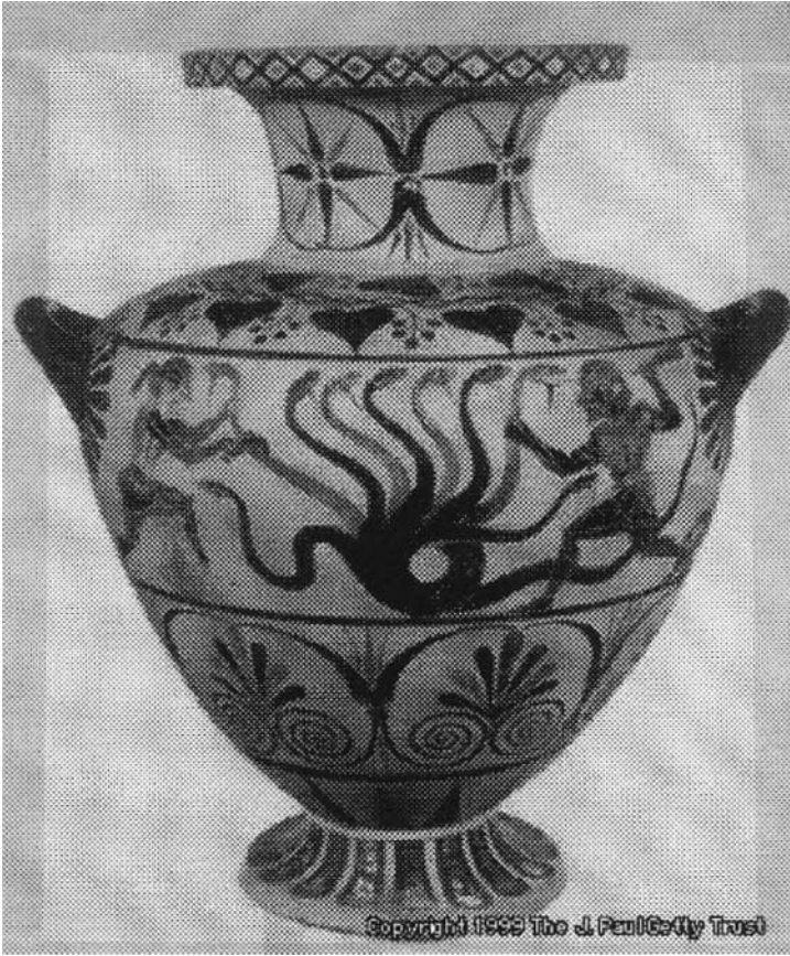
Hercules and Iolaus slaying the Lernean Hydra, Eritrian amphora, c. 525 B.C. Collection of the J. Paul Getty Museum, Malibu, California.

lopped off one of the hydra's heads, two new ones grew in its place. With the help of his nephew Iolaus, he eventually killed the monster by cutting off a central head and cauterizing the stump with a flaming branch. He then dipped his arrows in the gall of the slain beast, which gave his projectiles fatal power and allowed him to complete his labors.