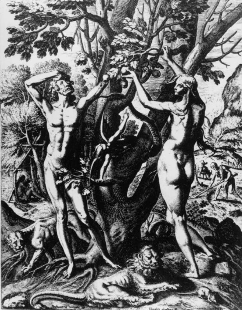
The New World as paradise , by Theodore de Bry, 1588. Thomas Hariot, A briefe and true report of the new found land of Virginia (1590).

tained the lie, promising prospective laborers a six-hour workday in which the “sappe of their bodies” would not “be spent for other mens profite.” 6 Many colonists had headed toward Virginia, on the Sea-Venture and other vessels, with the “heate and zeale” of a “romain year of Iubile.” The biblical jubilee (Leviticus) authorized the call for an end to