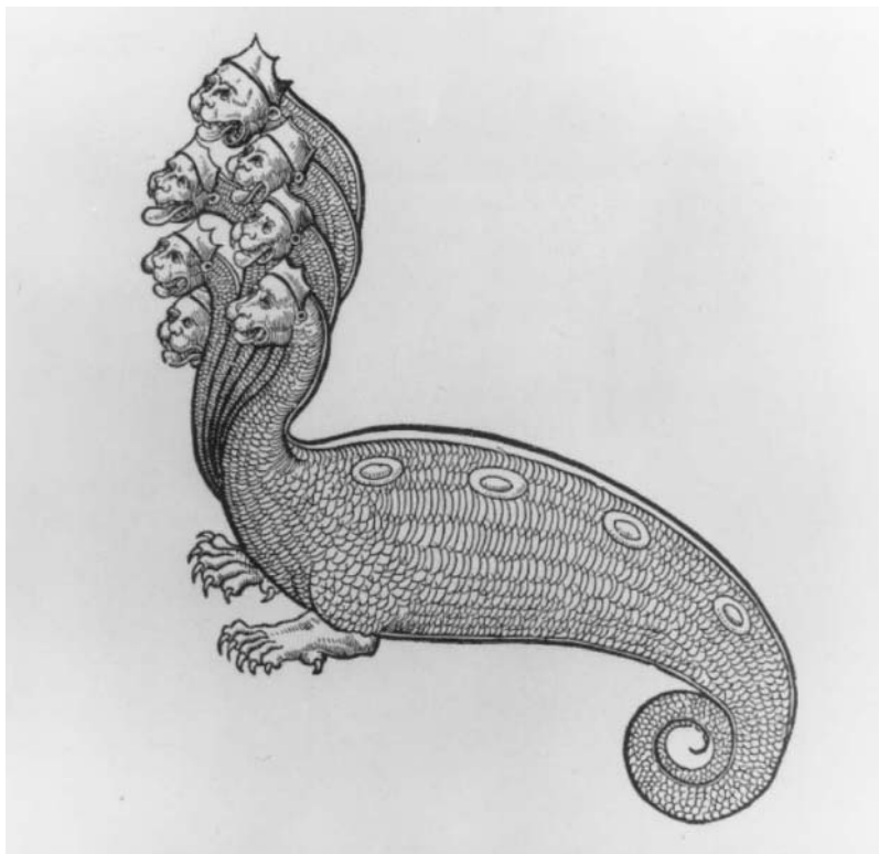
The Hydra, supposed to be killed by Hercules. Edward Topsell, Historie of Serpents (1608).

declare martial law at his discretion, the gentlemen had a terrible time establishing their authority, for the hurricane and the shipwreck had leveled class distinctions. Confronted with resistance that proposed an alternative way of life, the officials of the Virginia Company responded by destroying the commoning option and by reasserting class discipline through labor and terror, new ways of life and death. They reorganized work and inflicted capital punishment. 34